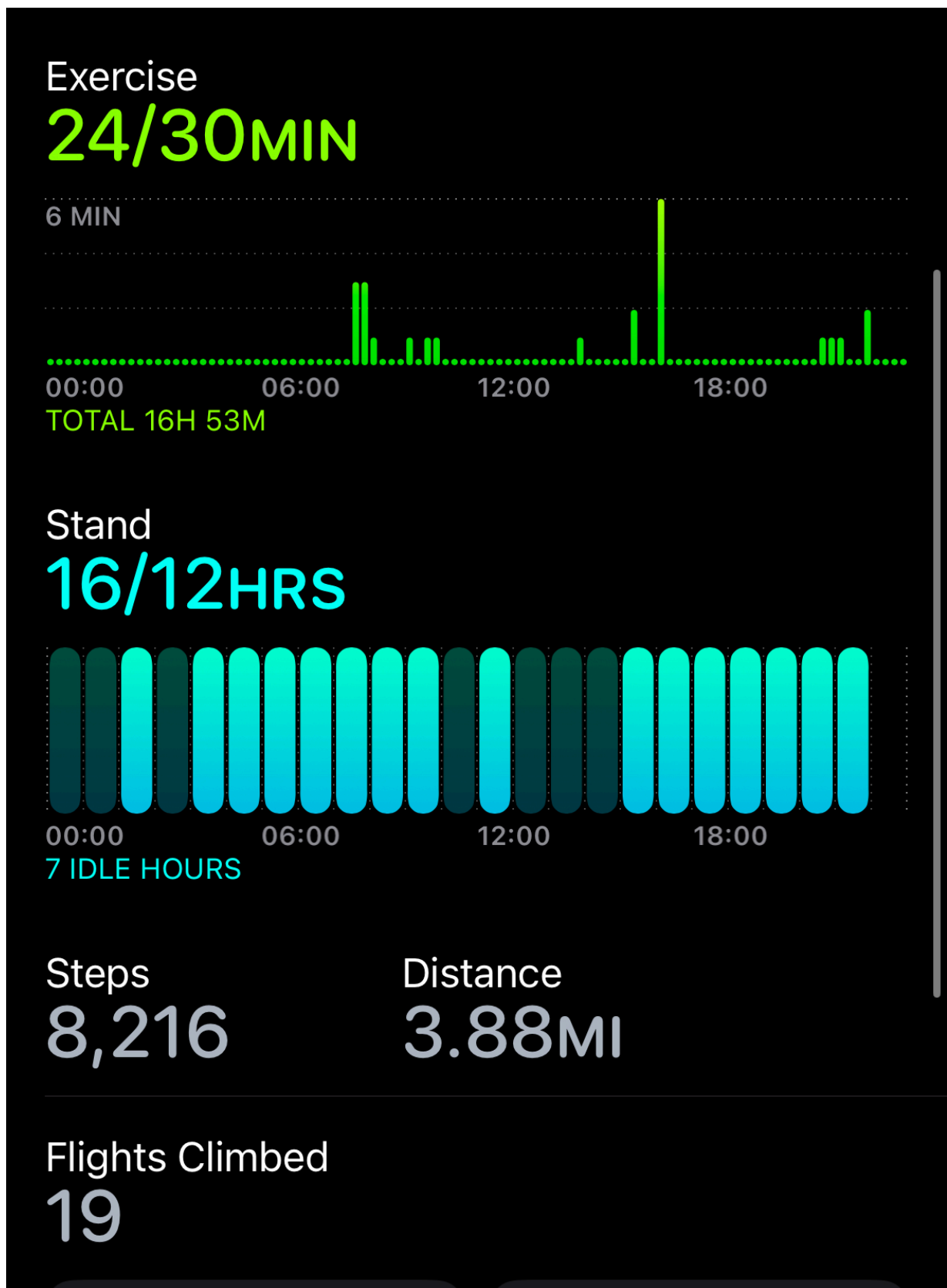
Fig. 2: 1AFF1217-09FA-4652-B213-9C245B9EBDCD.jpg