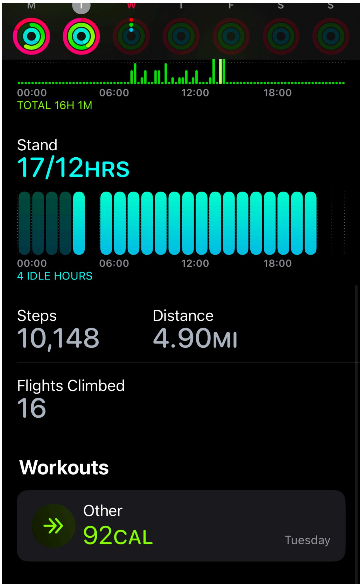
Fig. 1: 2A8CB5C1-F236-47C2-8E9F-9F88E8379976.jpg